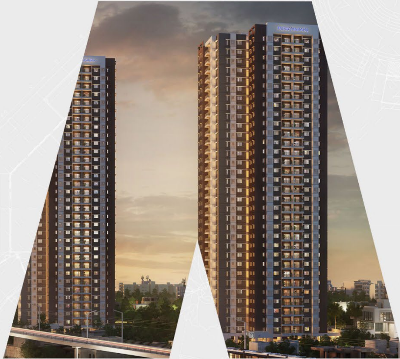
A PURAVANKARA HOME AT PURVA BLUBELLE